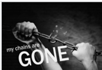
My Chains Are Gone

Today we learn more about our freedom in Christ and all its divine implications. Certainly we have been set free from the tyranny of sin, punishment and death. But it doesn't stop there, we received a new life and are now citizens of heaven, being freed from the old way of doing things. Our old alliances of serving ourselves or this world have been crucified and replaced with a new master—the Lord Jesus Christ. So, logically, who would you rather serve? Sin, self, the world or Jesus?